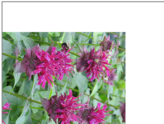
Raspberry Wine Beebalm flowers

This plant does best in full sun to partial shade. It is very adaptable to both dry and moist locations, and should do just fine under typical garden conditions. It is not particular as to soil type or pH. It is highly tolerant of urban pollution and will even thrive in inner city environments. This particular variety is an interspecific hybrid. It can be propagated by division; however, as a cultivated variety, be aware that it may be subject to certain restrictions or prohibitions on propagation.