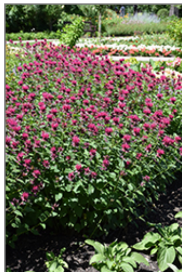
Raspberry Wine Beebalm in bloom