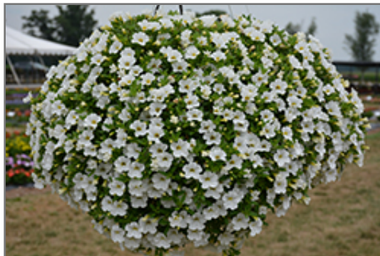
MiniFamous Uno White Calibrachoa in bloom

MiniFamous Uno White Calibrachoa is a fine choice for the garden, but it is also a good selection for planting in outdoor containers and hanging baskets. Because of its trailing habit of growth, it is ideally suited for use as a 'spiller' in the 'spiller-thriller-filler' container combination; plant it near the edges where it can spill gracefully over the pot. Note that when growing plants in outdoor containers and baskets, they may require more frequent waterings than they would in the yard or garden.