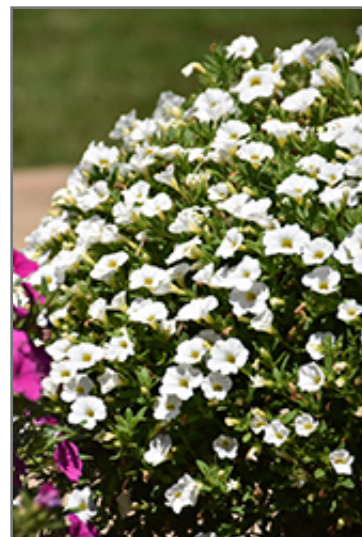
MiniFamous Uno White Calibrachoa flowers

MiniFamous Uno White Calibrachoa is a dense herbaceous annual with a trailing habit of growth, eventually spilling over the edges of hanging baskets and containers. Its medium texture blends into the garden, but can always be balanced by a couple of finer or coarser plants for an effective composition.