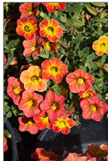
Cabaret Diva Orange Calibrachoa flowers

This plant will require occasional maintenance and upkeep. Trim off the flower heads after they fade and die to encourage more blooms late into the season. It is a good choice for attracting bees and hummingbirds to your yard, but is not particularly attractive to deer who tend to leave it alone in favor of tastier treats. It has no significant negative characteristics.