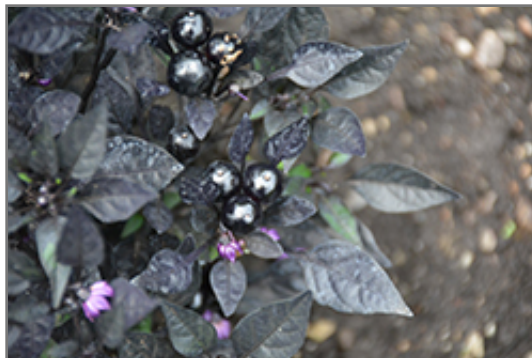
Onyx Red Ornamental Pepper fruit

Onyx Red Ornamental Pepper is an herbaceous annual with an upright spreading habit of growth. Its medium texture blends into the garden, but can always be balanced by a couple of finer or coarser plants for an effective composition.