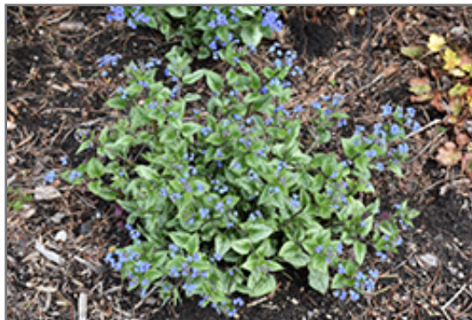
Queen of Hearts Bugloss in bloom

Queen of Hearts Bugloss is a fine choice for the garden, but it is also a good selection for planting in outdoor pots and containers. It can be used either as 'filler' or as a 'thriller' in the 'spiller-thriller-filler' container combination, depending on the height and form of the other plants used in the container planting. Note that when growing plants in outdoor containers and baskets, they may require more frequent waterings than they would in the yard or garden.