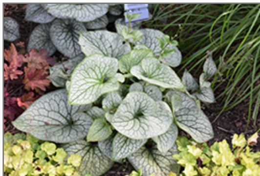
Queen of Hearts Bugloss foliage