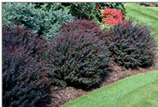
Sunjoy Mini Maroon Japanese Barberry

Sunjoy Mini Maroon Japanese Barberry is recommended for the following landscape applications;