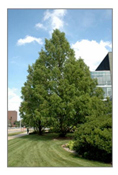
Dawn Redwood