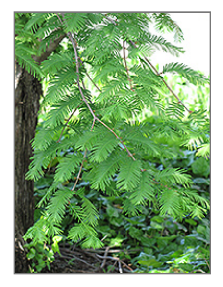
Dawn Redwood foliage