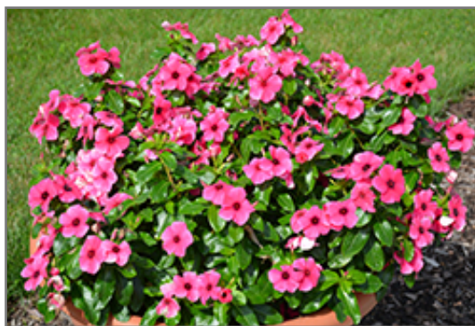
Tattoo Raspberry Vinca in bloom