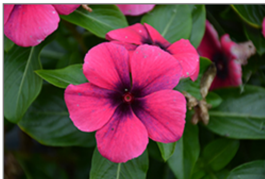
Tattoo Raspberry Vinca flowers

Tattoo Raspberry Vinca is recommended for the following landscape applications;