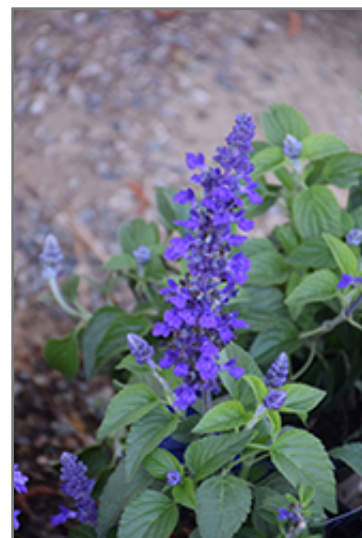
Mysty Salvia flowers