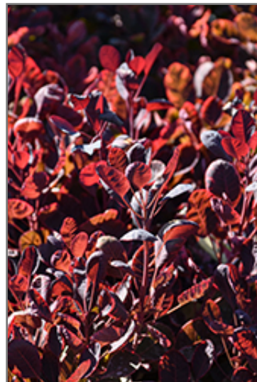
Velveteeny Purple Smokebush foliage

Velveteeny Purple Smokebush makes a fine choice for the outdoor landscape, but it is also well-suited for use in outdoor pots and containers. With its upright habit of growth, it is best suited for use as a 'thriller' in the 'spiller-thriller-filler' container combination; plant it near the center of the pot, surrounded by smaller plants and those that spill over the edges. It is even sizeable enough that it can be grown alone in a suitable container. Note that when grown in a container, it may not perform exactly as indicated on the tag - this is to be expected. Also note that when growing plants in outdoor containers and baskets, they may require more frequent waterings than they would in the yard or garden.