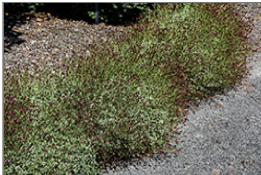
Little Angel Burnet in bloom

Little Angel Burnet is recommended for the following landscape applications;