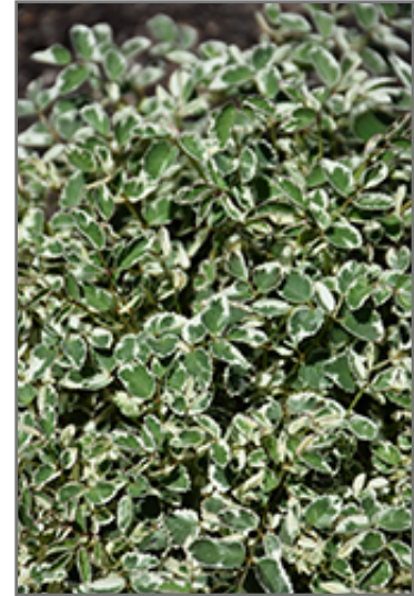
Little Angel Burnet flowers

This plant does best in full sun to partial shade. It prefers to grow in average to moist conditions, and shouldn't be allowed to dry out. It is not particular as to soil type or pH. It is somewhat tolerant of urban pollution. This is a selected variety of a species not originally from North America. It can be propagated by division; however, as a cultivated variety, be aware that it may be subject to certain restrictions or prohibitions on propagation.