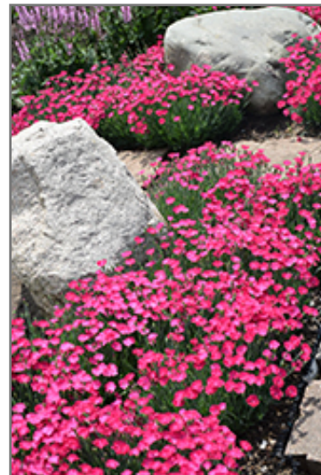
Paint The Town Magenta Pinks in bloom

This is a relatively low maintenance plant, and is best cleaned up in early spring before it resumes active growth for the season. It is a good choice for attracting bees and butterflies to your yard, but is not particularly attractive to deer who tend to leave it alone in favor of tastier treats. It has no significant negative characteristics.