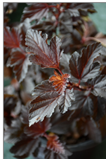
Fireside Ninebark flowers