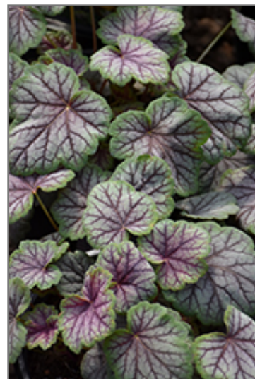
Green Spice Coral Bells foliage