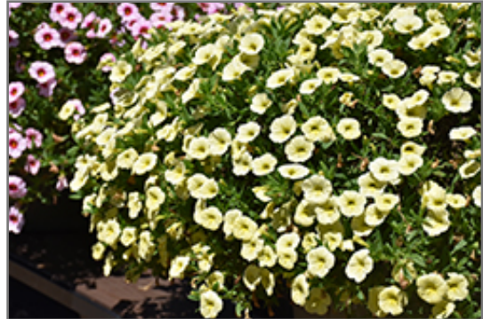
Cabaret Lemon Yellow Calibrachoa flowers

Cabaret Lemon Yellow Calibrachoa will grow to be about 10 inches tall at maturity, with a spread of 18 inches. When grown in masses or used as a bedding plant, individual plants should be spaced approximately 12 inches apart. Its foliage tends to remain low and dense right to the ground. This fast-growing annual will normally live for one full growing season, needing replacement the following year.