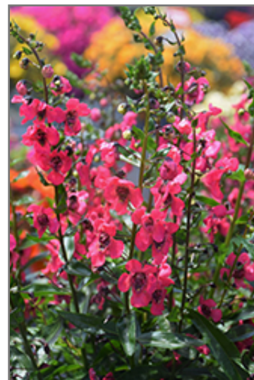
Archangel Cherry Red Angelonia flowers

Archangel Cherry Red Angelonia is a fine choice for the garden, but it is also a good selection for planting in outdoor containers and hanging baskets. It is often used as a 'filler' in the 'spiller-thriller-filler' container combination, providing a mass of flowers against which the larger thriller plants stand out. Note that when growing plants in outdoor containers and baskets, they may require more frequent waterings than they would in the yard or garden.