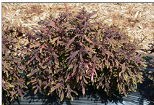
Under The Sea Lion Fish Coleus