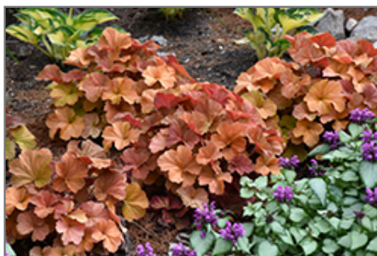
Northern Exposure Amber Coral Bells