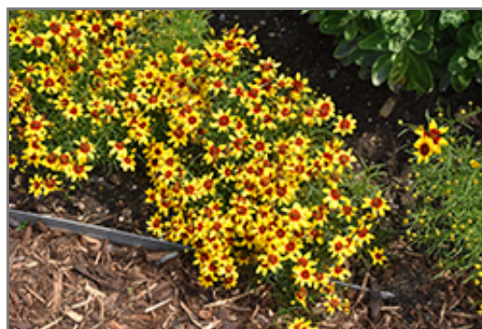
Sizzle And Spice Curry Up Tickseed in bloom