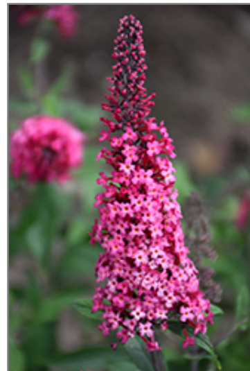
Monarch Prince Charming Butterfly Bush flowers