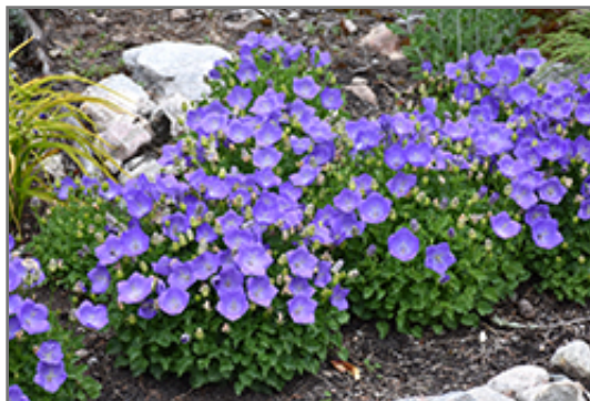
Rapido Blue Bellflower in bloom