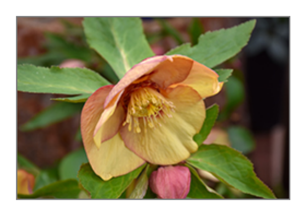
Winter Jewels Apricot Blush Hellebore flowers