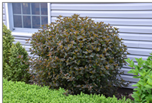
Ginger Wine Ninebark