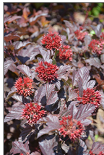
Ginger Wine Ninebark flower buds

Ginger Wine Ninebark is recommended for the following landscape applications;