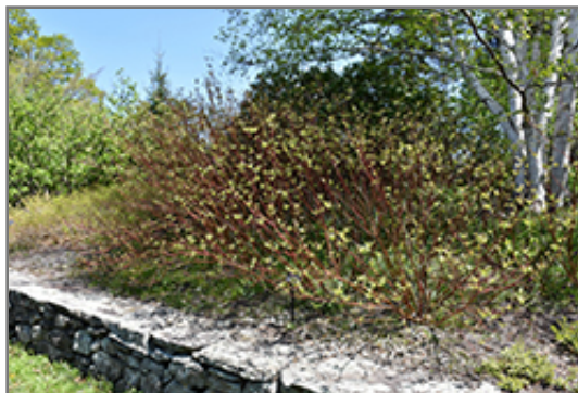
Bailey's Red Twig Dogwood in spring