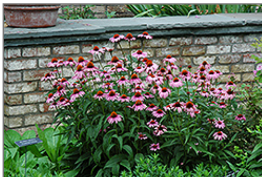
Magnus Coneflower in bloom