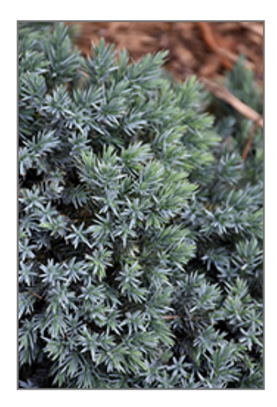
Blue Star Juniper foliage