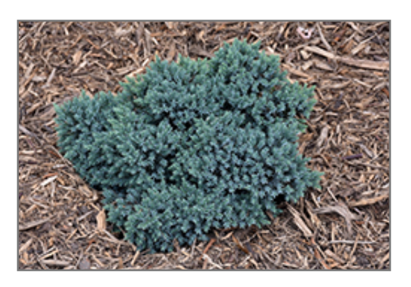
Blue Star Juniper