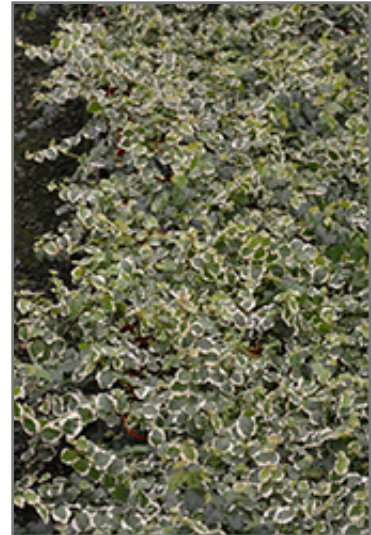
Variegated Creeping Fig in full