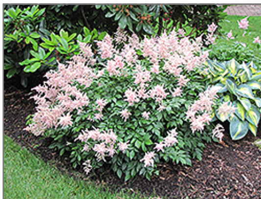
Peach Blossom Astilbe in bloom