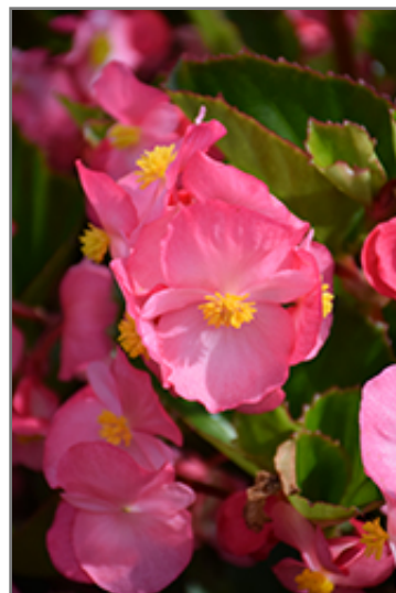
Big Pink Green Leaf Begonia flowers