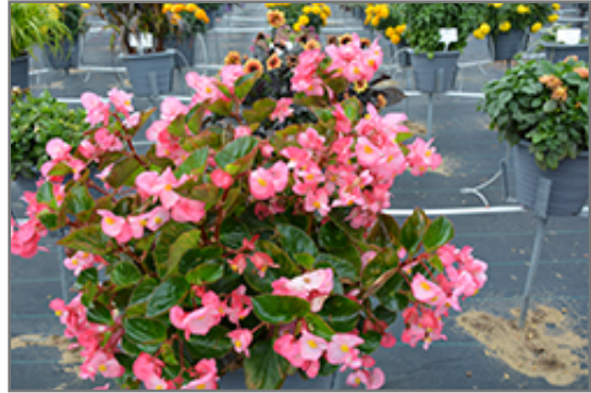
Big Pink Green Leaf Begonia in bloom

Big Pink Green Leaf Begonia is a fine choice for the garden, but it is also a good selection for planting in outdoor containers and hanging baskets. It is often used as a 'filler' in the 'spiller-thriller-filler' container combination, providing a mass of flowers and foliage against which the larger thriller plants stand out. Note that when growing plants in outdoor containers and baskets, they may require more frequent waterings than they would in the yard or garden.