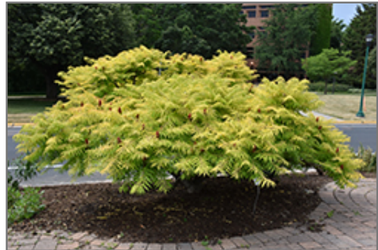
Tiger Eyes Sumac