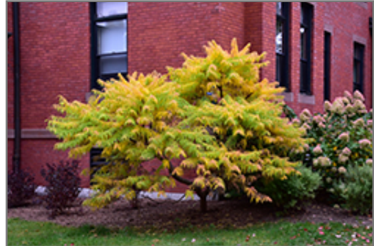
Tiger Eyes Sumac in fall