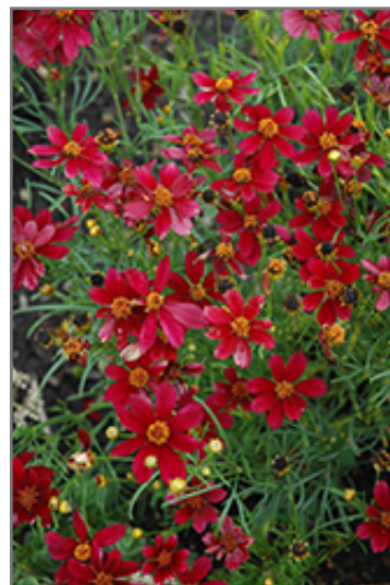
Red Satin Tickseed flowers