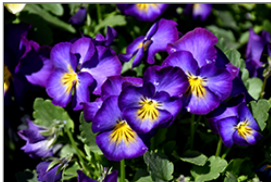
Halo Violet Pansy flowers

Halo Violet Pansy is recommended for the following landscape applications;