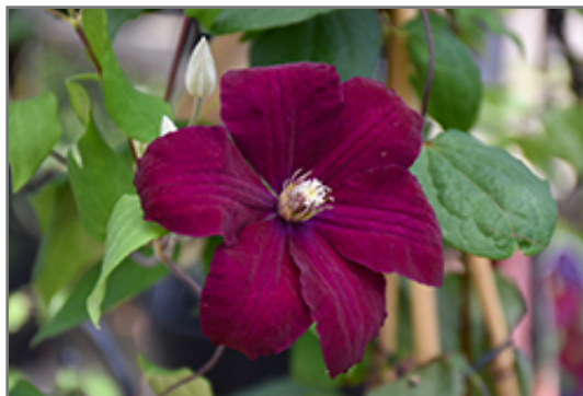
Rouge Cardinal Clematis flowers