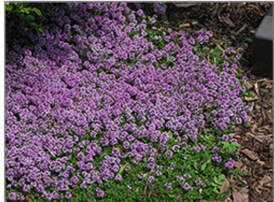
Purple Carpet Creeping Thyme in bloom