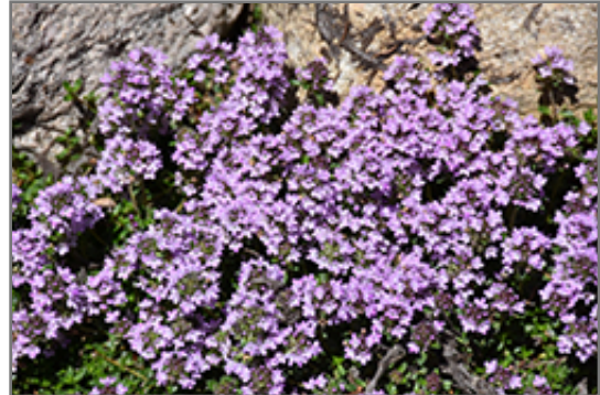
Purple Carpet Creeping Thyme flowers