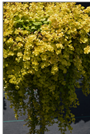
Golden Creeping Jenny foliage

Golden Creeping Jenny is a fine choice for the garden, but it is also a good selection for planting in outdoor containers and hanging baskets. Because of its spreading habit of growth, it is ideally suited for use as a 'spiller' in the 'spiller-thriller-filler' container combination; plant it near the edges where it can spill gracefully over the pot. Note that when growing plants in outdoor containers and baskets, they may require more frequent waterings than they would in the yard or garden.