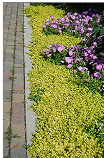
Golden Creeping Jenny