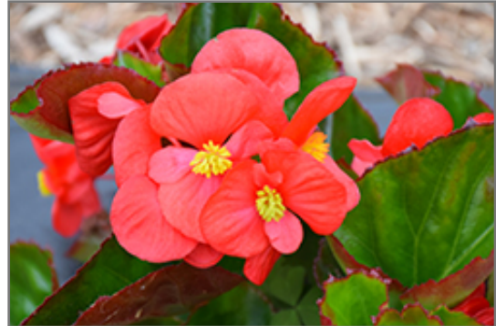
Big Red Green Leaf Begonia flowers

Big Red Green Leaf Begonia is recommended for the following landscape applications;