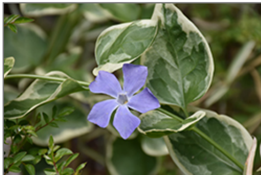
Variegated Periwinkle flowers

Variegated Periwinkle is recommended for the following landscape applications;