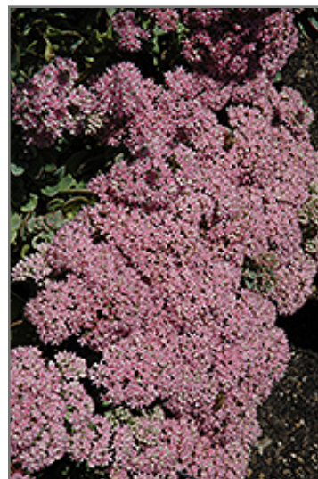
Lime Zinger Stonecrop flowers Photo courtesy of NetPS Plant Finder

Lime Zinger Stonecrop is recommended for the following landscape applications;