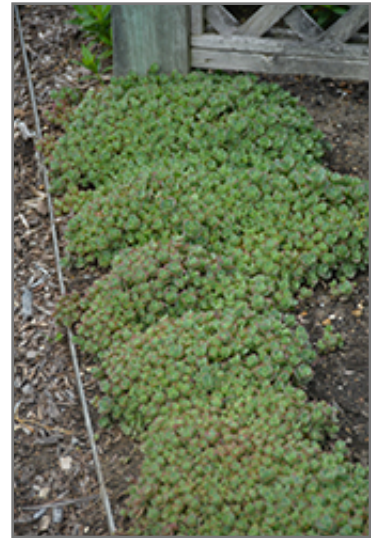
Lime Zinger Stonecrop

Lime Zinger Stonecrop is a fine choice for the garden, but it is also a good selection for planting in outdoor pots and containers. Because of its spreading habit of growth, it is ideally suited for use as a 'spiller' in the 'spiller-thriller-filler' container combination; plant it near the edges where it can spill gracefully over the pot. Note that when growing plants in outdoor containers and baskets, they may require more frequent waterings than they would in the yard or garden.