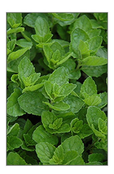
Spearmint foliage

Aside from its primary use as an edible, Spearmint is sutiable for the following landscape applications;