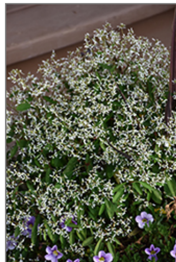
Breathless White Euphorbia flowers