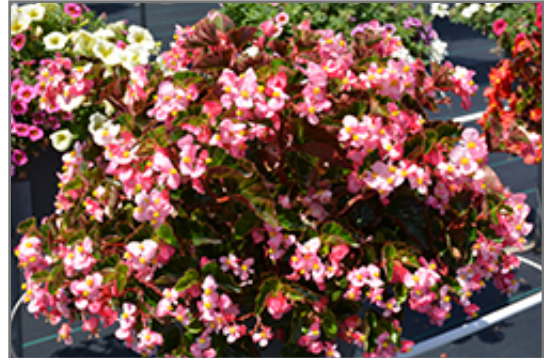
BabyWing Pink Begonia in bloom

BabyWing Pink Begonia is a fine choice for the garden, but it is also a good selection for planting in outdoor containers and hanging baskets. It is often used as a 'filler' in the 'spiller-thriller-filler' container combination, providing a mass of flowers and foliage against which the thriller plants stand out. Note that when growing plants in outdoor containers and baskets, they may require more frequent waterings than they would in the yard or garden.