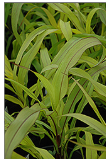
Jester Millet foliage