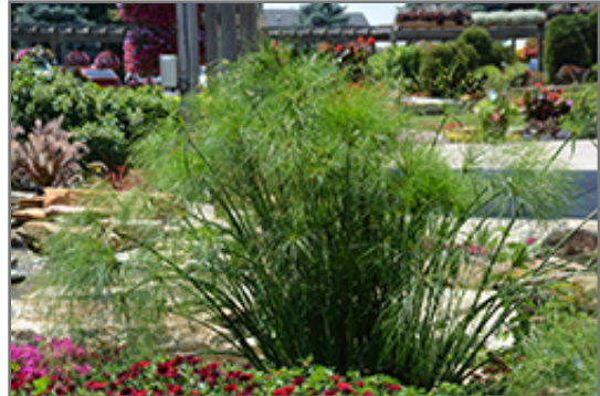
King Tut Egyptian Papyrus