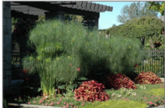
King Tut Egyptian Papyrus