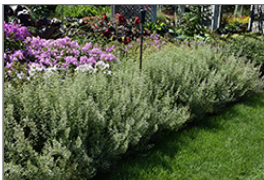
Montrose White Dwarf Calamint in bloom