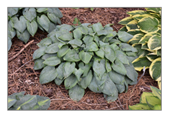
Fragrant Blue Hosta